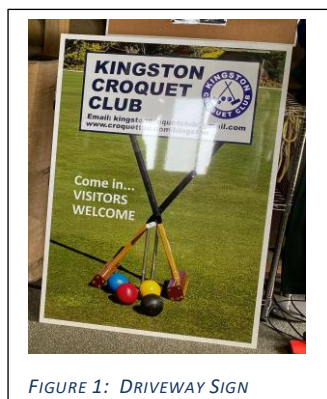
FIGURE 1: DRIVEWAY SIGN

Many of you may have seen the new signs in the club house.