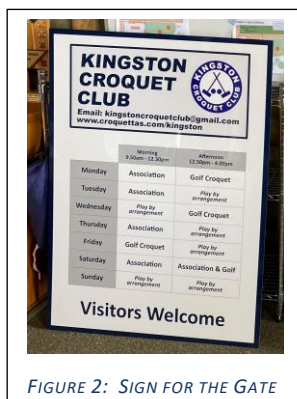
FIGURE 2: SIGN FOR THE GATE

In the new year, Figure 1. will be mounted at the entrance of the drive and Figure 2 will be mounted on the wire gate in the car park.