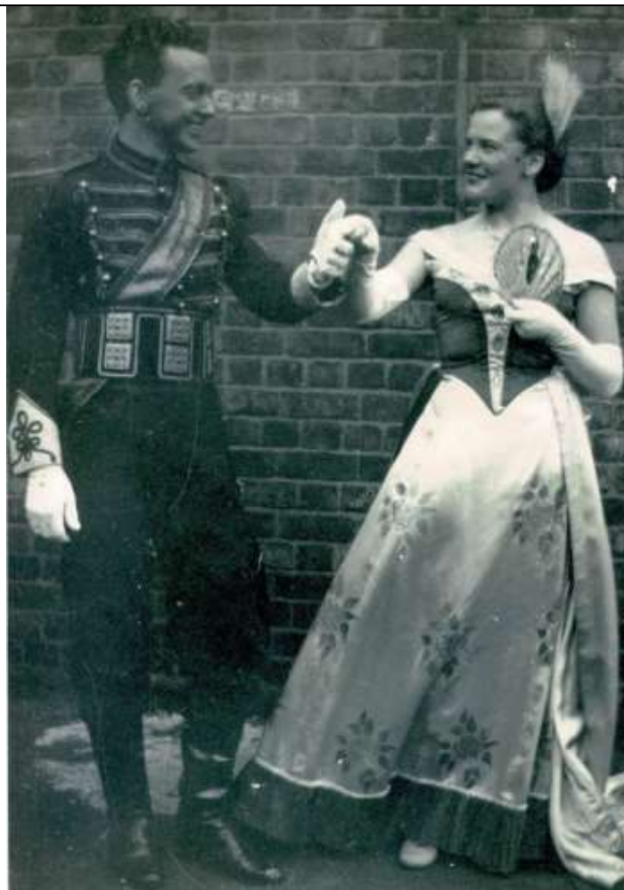
****Meeting on stage together****

This month I would like to introduce you to two stalwarts of the Club. I hope you enjoy their story.