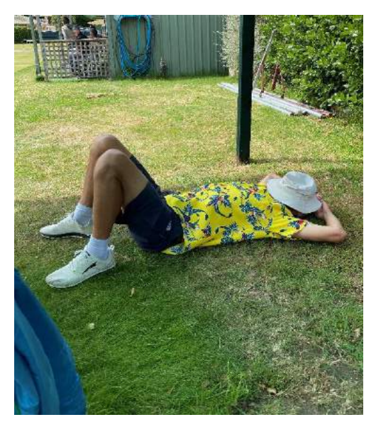
How to relax!!!!!