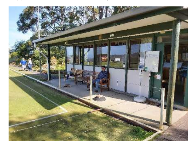
The clubhouse without central poles