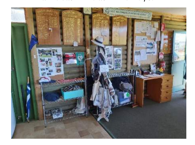
Re-organised internal of the clubhouse