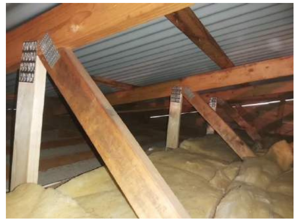
Preparation Work - Brackets installed, and extra supports added in the ceiling area