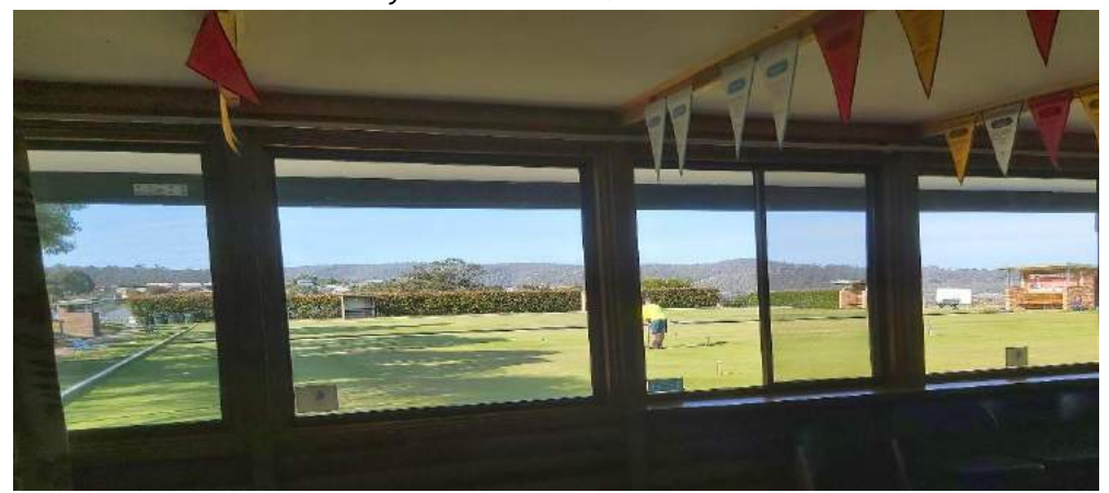
Uninterrupted view from within the clubhouse