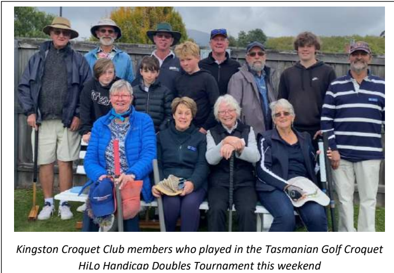
Kingston Croquet Club members who played in the Tasmanian Golf Croquet HiLo Handicap Doubles Tournament this weekend